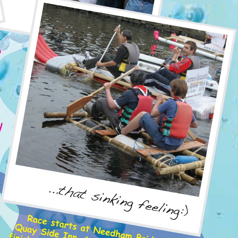
...that sinking feeling:)

Create and build a water worthy craft to race up Newry Canal and be crowned Bath Tub Champion of 2011! Prizes for Best Design & Best Dress Costume